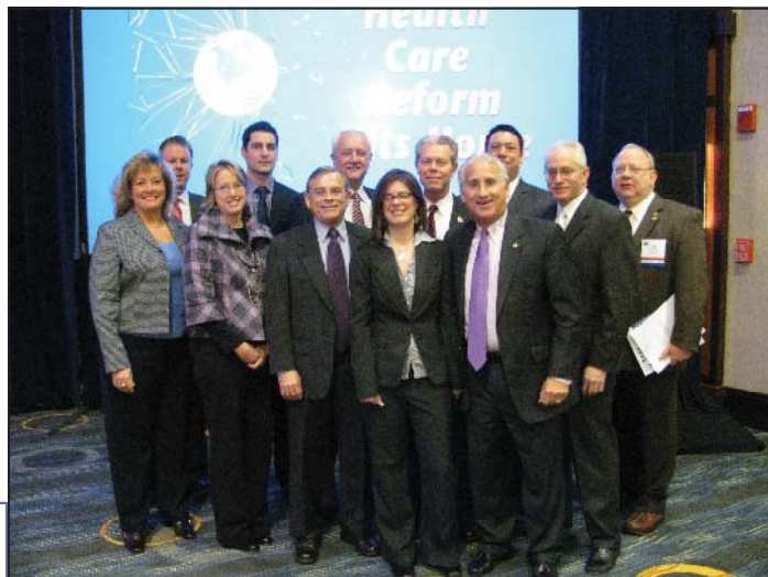
The Indiana Delegation at Capitol Conference 2011